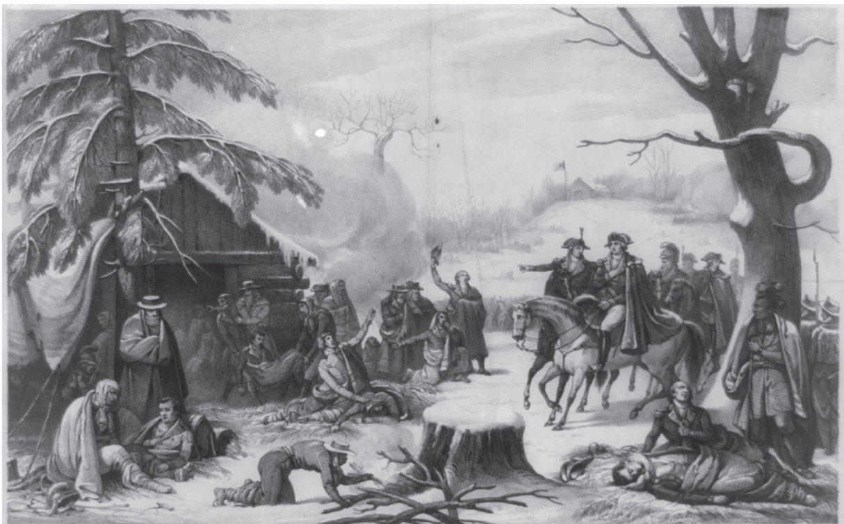
“Valley Forge, 1777,” painted in 1869 by a French artist who admired Lafayette. It shows General Washington and the Marquis de Lafayette, a French officer who served with Washington, visiting some troops of the Continental Army.

From an account by Colonel William Prescott of Pepperell, June 1775. He commanded the rebel forces during the Battle of Bunker Hill.