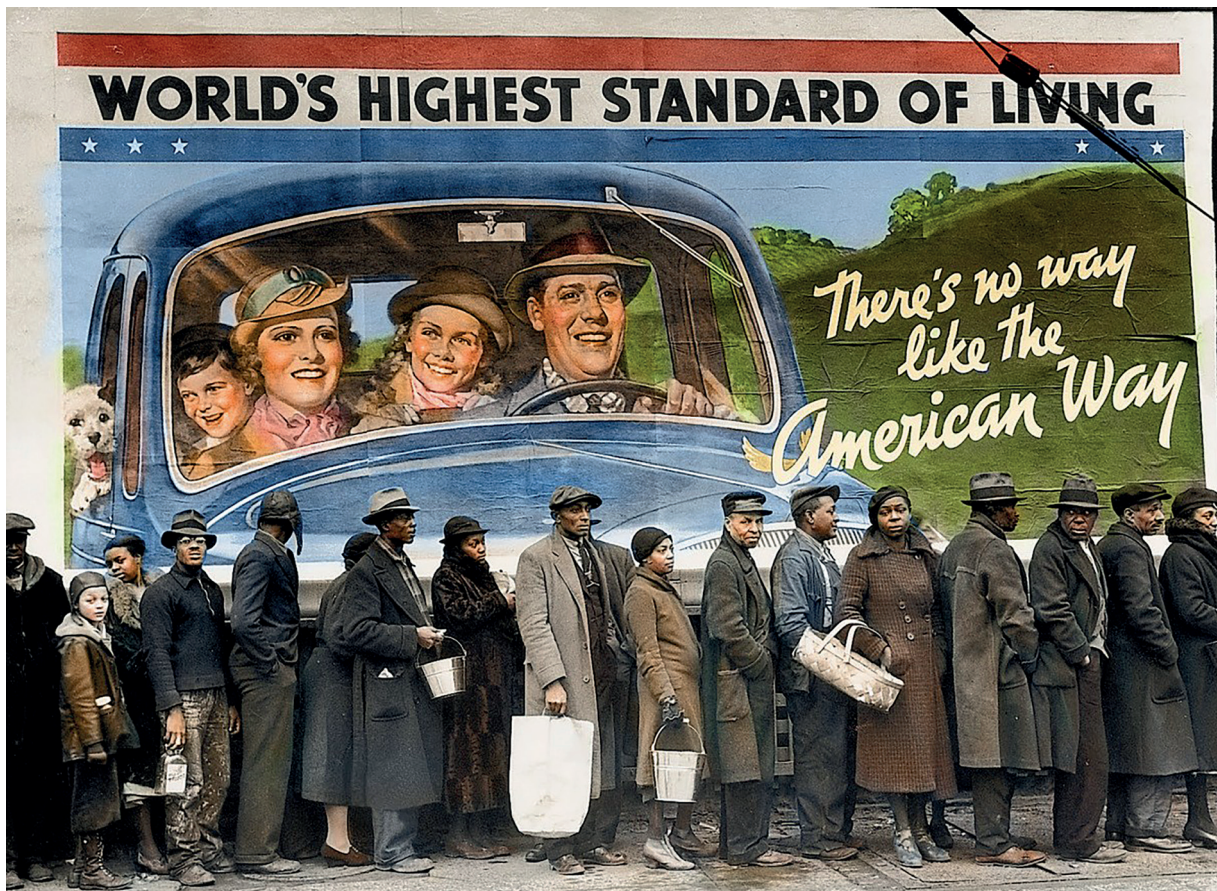
A photograph taken in Louisville, Kentucky, 1937. People wait in line for food and clothing from a relief station in front of a billboard.