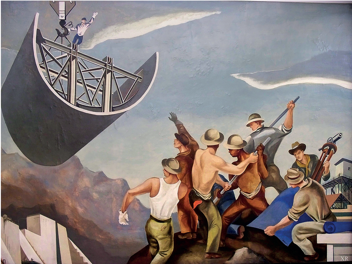
Part of a wall painting from 1938 by William Gropper showing a dam under construction in the 1930s. He was an artist paid by the Works Progress Administration.